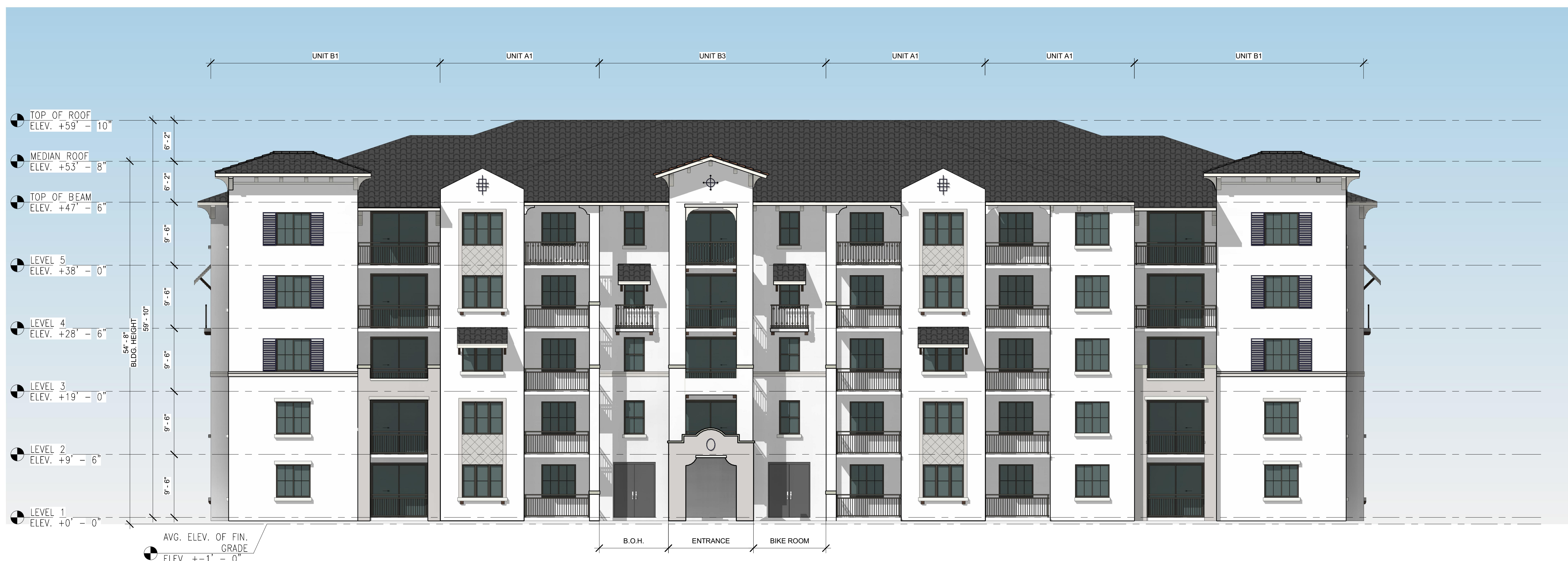
1 FRONT ELEVATION 1/8" = 1'-0"